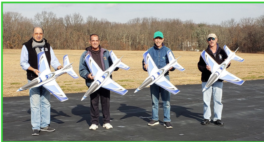
of the “4 Marlins Precision Flying Team,”