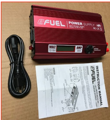
Power Supply used twice $150.00

Academy Model of Aeronautics Charter # 434