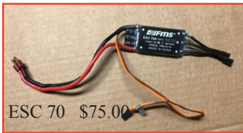
ESC 70 $75.00

CONSCENDO Evolution Power Glider with three matching 1300 mAh batteries. Completed and maiden flown $275.00 Contact Alex 732-816-1810 by voice or text for any of these items