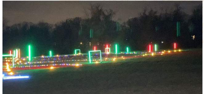
From the ground, it looks like this. A maze of lights.

The last Night -Fly for 2020 was held on Sunday December 13th. Put together by Rich and Mike D. Pictured below is the awesome Christmas tree as put together by Rich McDonald. From the ground it is a maze of obstacles and lit up poles that the FPV pilots try and navigate. It has a twinkling star on the top and is 279 ft tall (if it were standing vertically), horizontally. 160 wide, 600 Christmas lights and a few thousand LED's.