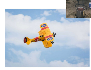
"Two wings are Better then One, and Way Better then None."

This months night flying event will take place right after the regular meeting on July 30th. Sunset on that day is at 8:12 PM Bring out any aircraft that you are comfortable flying at night.