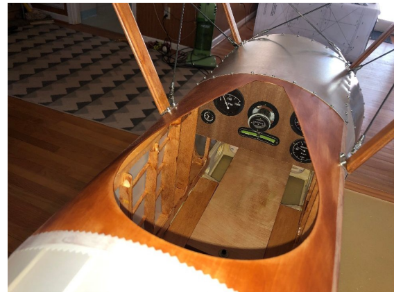
Notice the detailed gauges