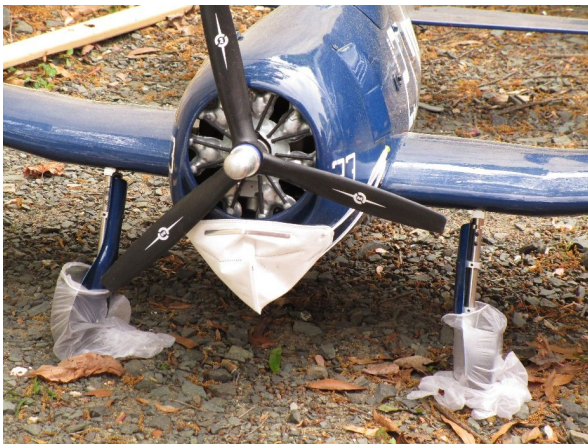
Larry's Hellcat with PPE

(Continued from page 1) Larry separated the planes, put masks on each and covered the landing gear with PPE gloves. When I looked up information on the servos on line, this is what it said.