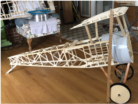
Notice the yardstick standing next to the plane.