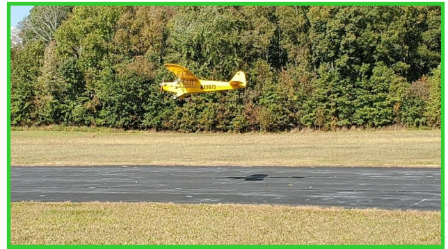
Armand makes an approach but had to go around because of gusty conditions. A safe landing at the end.