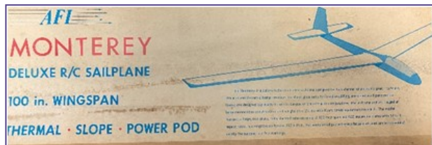
100” wingspan Monterey , $50