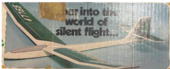
78” Maveric Sailplane Kit $40