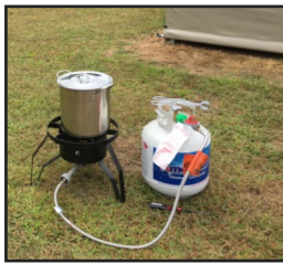
Well, its not the witches cauldron ! but its close.

Events are scheduled for Saturdays, with the rain