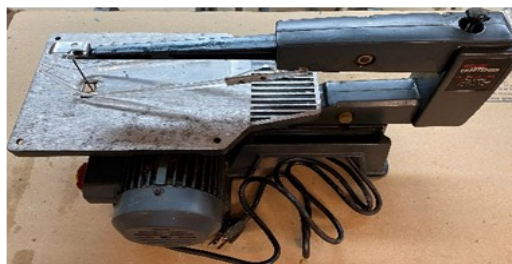
Craftsman Jig Saw. Cast adjustable angle table. runs but needs some cleaning $30