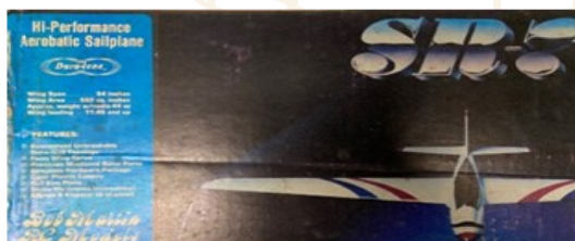
SR-7 Aerobatic Sailplane $60, 54 inch wingspan