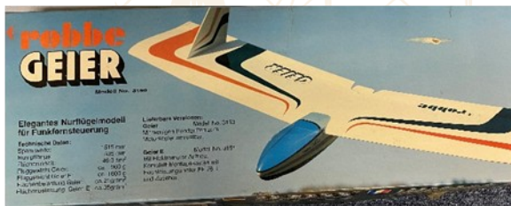
60 “ Flying wing, with molded nose pod $50