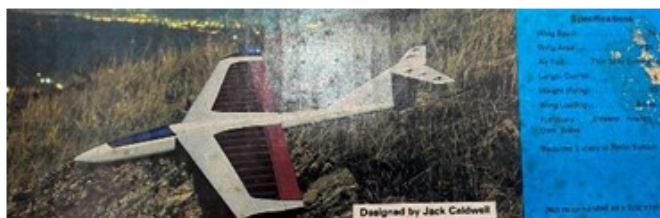
74” Freedom Sailplane $75