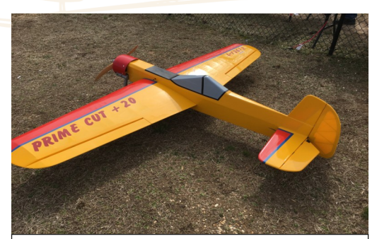
Can you name the NJ native builder of this airplane?