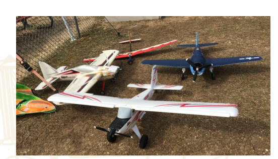
Tony's Armada of flying aces.