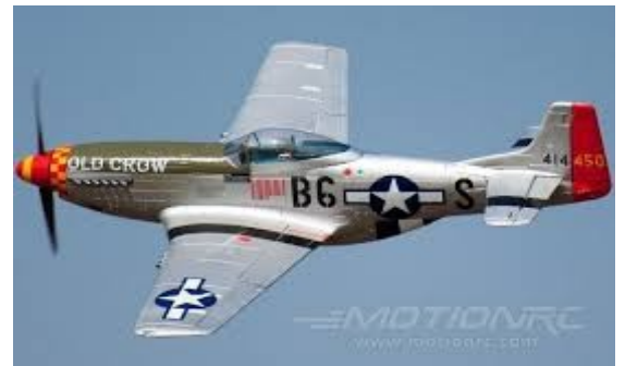
This is not a picture of the actual plane, only a representation.

Price of the motor alone is worth the $250?