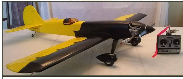
Great Planes Super Sportster 60, with OS 90-4 stroke, wing span of 60" Futaba radio 4 channel radio/FM, 5 servos, covered in 21 century covering.

Over the past 30 years, Gerry has a vast collection of building tools, engines and accessories that he would like to sell.