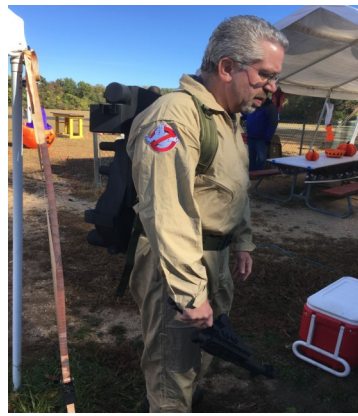
Ghost capturing machine (backpack) and gun are made with 3D printer