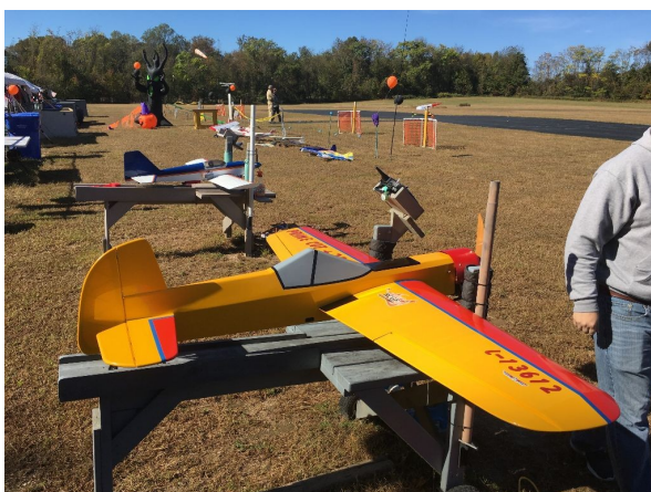
Two nice Planes just prior to their demise.