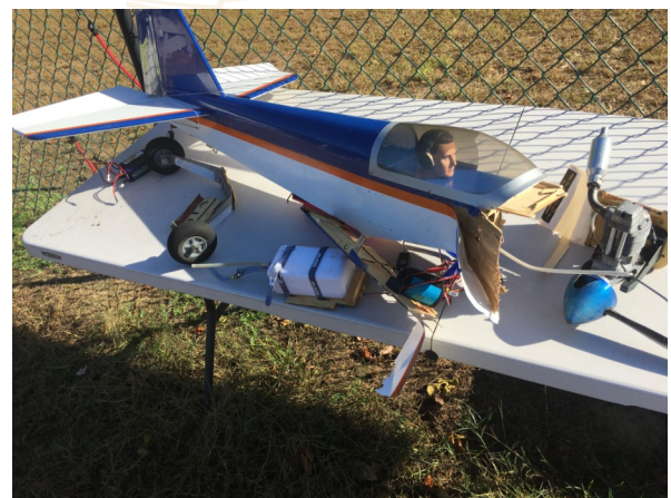
This is what happens when you try and watch someone else's plane and not your own.