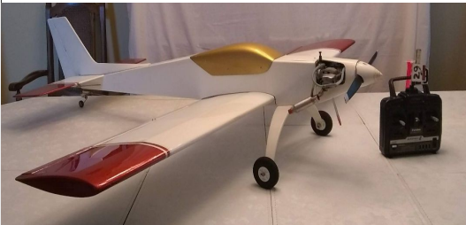
Goldberg Tiger 2, 61" wingspan, OS70-4 stroke, 5 servos, Futaba radio, 5 channel, Additional 2 gal glow fuel, glo plugs.

His home is a 18 Merlot Ct. Monroe Township, NJ 08831