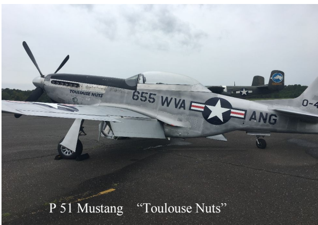
P 51 Mustang "Toulouse Nuts"