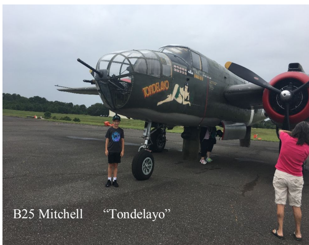
B25 Mitchell "Tondelayo"