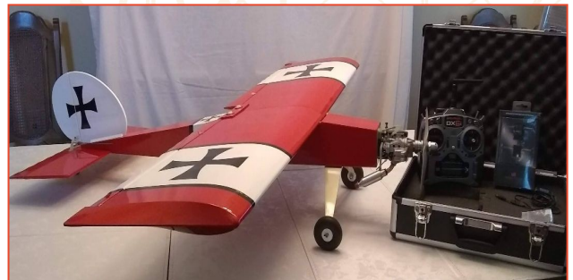
Great Planes Big Stik 40 ARF, OS 70-4 stroke, 5 servos, NEW Spectrum 6i Transmitter, extra receiver, and trans carry case. Includes 2 gals glo fuel