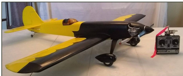
Great Planes Super Sportster 60, with OS 90-4 stroke, wing span of 60" Futaba radio 4 channel radio/FM, 5 servos, covered in 21 century covering.

Over the past 30 years, Gerry has a vast collection of building tools, engines and accessories that he would like to sell.