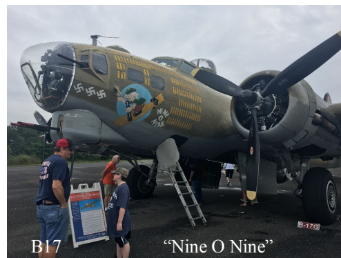
B17 "Nine O Nine"