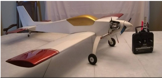
Goldberg Tiger 2, 61" wingspan, OS70-4 stroke, 5 servos, Futaba radio, 5 channel, Additional 2 gal glow fuel, glo plugs.

His home is a 18 Merlot Ct. Monroe Township, NJ 08831