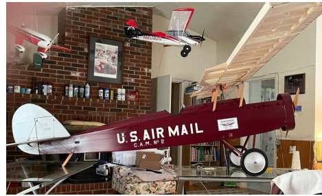
The wing belongs to Tony's latest creation. A U.S. Air Mail plane.