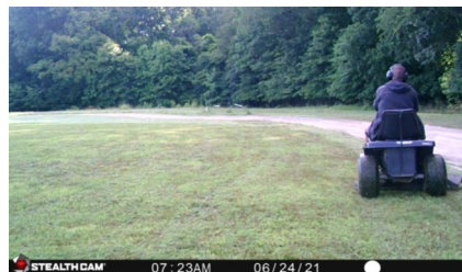
The camera caught this person in the act of cutting the grass and trying to escape. Take one guess who it was??