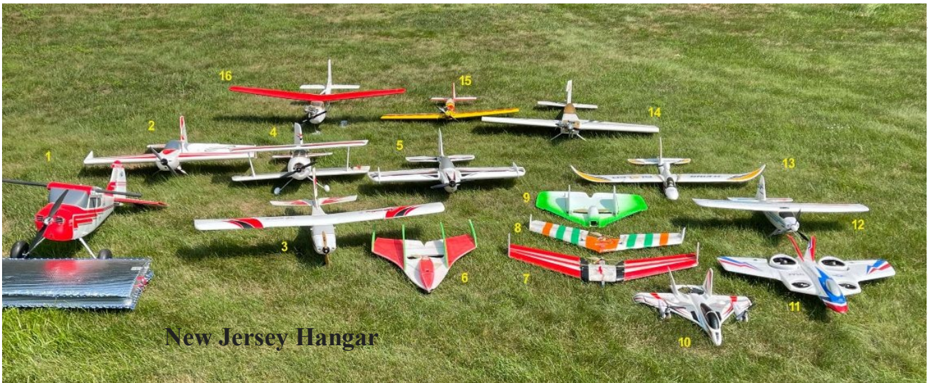
New Jersey Hangar