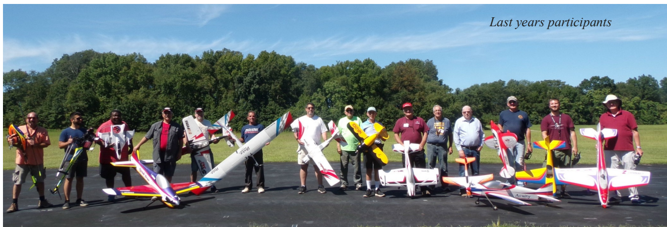
Last years participants

https://www.nsrca.us/index.php/archives-rules-and-sequences?task=document.viewdoc&id=654