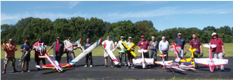
Pictured above is the group from 2020.

You can participate with whatever aircraft you are comfortable with. We have even had helis take part.