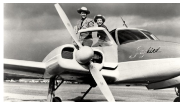
Pictured above is Sky King in his Cessna 310 Songbird. Do you remember this TV show?