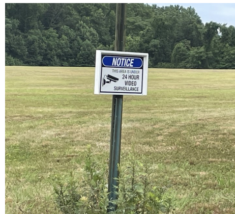
A new Video Security sign and camera was installed at the field.