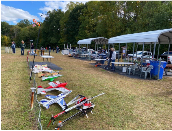
An early morning look at the flight line. There were over 25 planes and helis taking part in flight demonstrations and flight training.