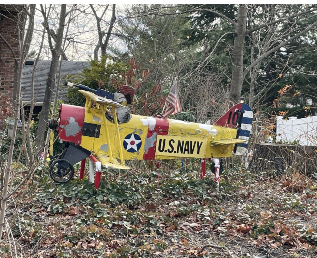
This plane is about 7 ft long and is located in someone's back yard in Sayreville. By the looks of the overgrowth and peeling paint, it's been there for awhile.