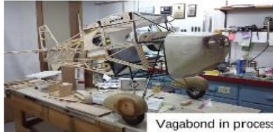
Vagabond in process