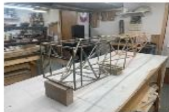
50% Smith Miniplane fuselage.