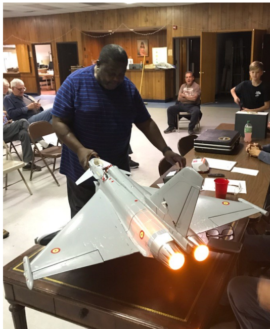
Mr K lights up the afterburners at the September meeting.